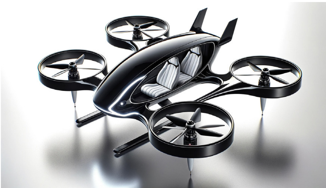
An unflyable and not manufacturable passenger drone produced by an AI-powered image generator. Note the uneven number of propeller blades, insufficient landing gear skids, and lack of doors for passenger safety. (Image is illustrative and was developed specifically for this article.)