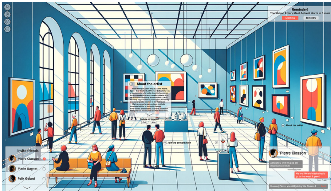
An AI-generated conceptual image refined through an image-editing software that depicts a virtual, immersive, and engaging educational environment for museum visitors. (Image is illustrative and was developed specifically for this article.)

images with supplementary visual content (sketches, graphics, and so on) to create storyboards that illustrated novel formats, products, services, and experiences (see image below).