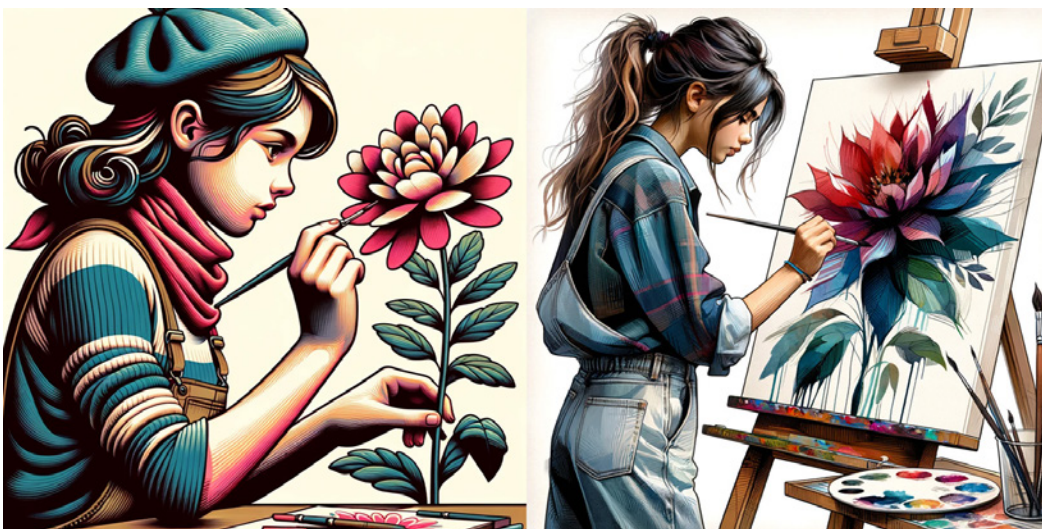
Design experts are needed to develop effective prompts, as shown in these two AI-generated images of a girl painting a flower. On the left, the image depicts a girl painting the petals of an actual flower and was generated using a basic prompt suggested by a large language model chatbot. On the right, the image depicts a girl painting a flower on a canvas and was generated using iterative prompts from a designer. (Images are illustrative and were developed specifically for this article.)