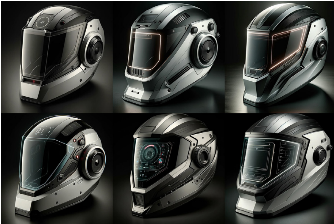
High-fidelity concept images of modern welding helmets powered by the Internet of Things that were created using a generative AI text-to-image software. Through iterative prompting, the industrial designer refined the initial designs to develop concept images with a futuristic aesthetic inspired by modern sports car styling. (Images are illustrative and were developed for this article.)

Additionally, with the ability to visualize concepts in high fidelity much earlier in the design process, companies can elicit more precise feedback from consumers as they work to fine-tune every element of the user experience (see images below). In product research and design alone, McKinsey estimates gen AI could unlock $60 billion in productivity 1 .