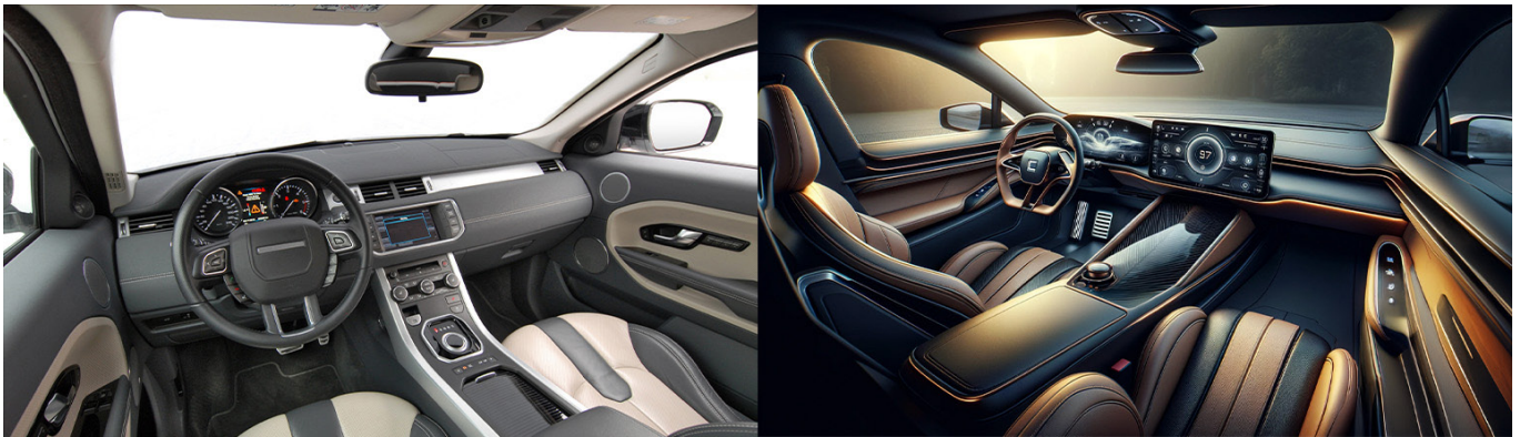
On the left, an image of a traditional car interior. On the right, a final high-fidelity image of a new design concept for a next-gen electric-vehicle interior, using the traditional car interior image as inspiration. To develop the new concept image, the industrial designer used iterative prompts in an image generator, detailing the desired features (large touch screen, premium materials, and so on) to create the updated interior. The designer then refined the output using image-editing software to create the final image. (The final image is illustrative and was developed specifically for this article.)

and how to evolve component interfaces, form factor, color, material, finish, and more for the latest models of electric vehicles (see images below). Without gen AI, creating images with similar detail and quality would have taken at least a week with many more iterations. This process empowered designers to bring a product experience to life in a far more tangible manner and in a fraction of the time.